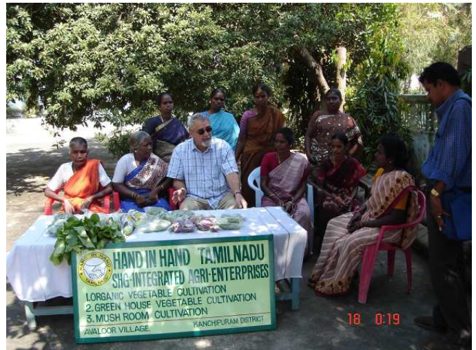
Percy Barnevik with his female entrepreneurs

Part of Hand in Hand Internationals success